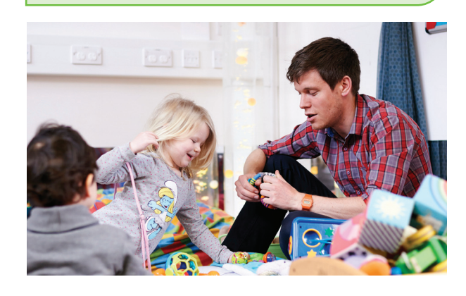
Charity number 1132581 | Company number 6952404