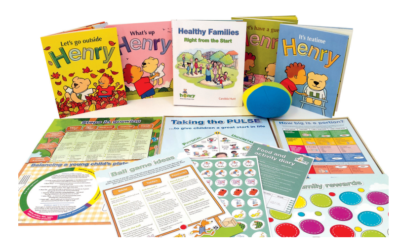
The HENRY Parent Toolkit - free to everyone joining a HENRY programme

The HENRY toolkit will help you give your child a great start in life, get the whole family involved, and keep track of how well you're doing.